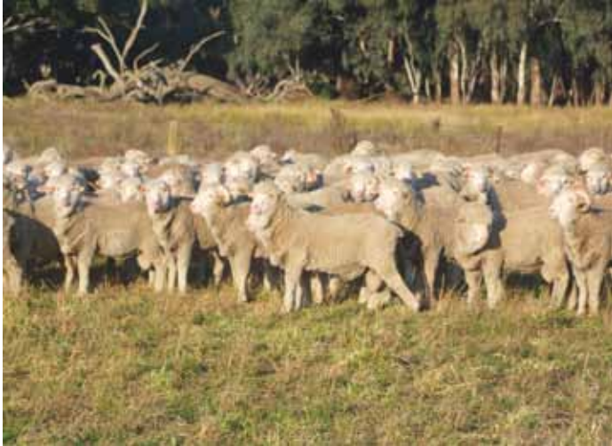
2011 Sale Rams