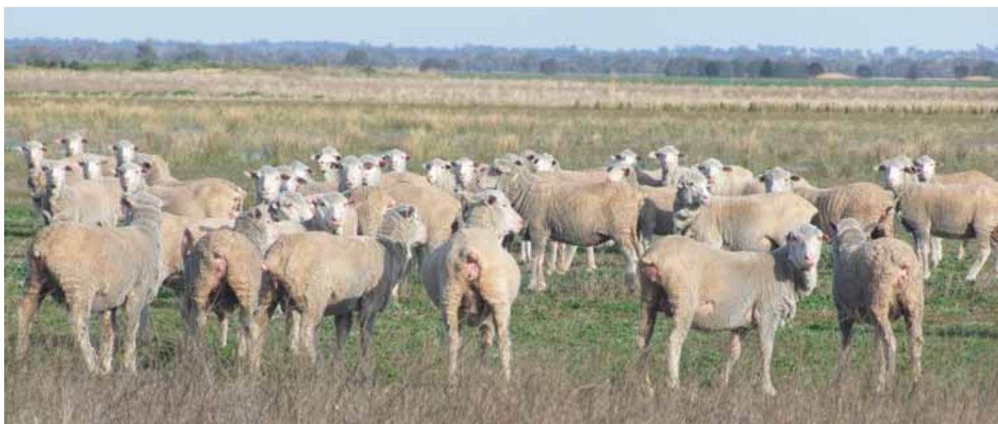
Pastora ewe weaners joined at seven months of age due to lamb 20th August.

Rick and Pam Martin from Borambola sold the wool off all their adult sheep for an average price of $2200 per bale. The top fleece line was 17.6 micron, yielded 74.6 and sold for 1395 cents per kilo or $2645 per bale. This wool sold on the 13th of January when the market was at much lower levels than present. Well deserved considering the effort that the Martins have put into their stock.