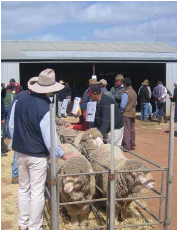
2 - Pastora Newsletter

By no means am I endeavouring to move away from private selection of our grade rams. I believe that apart from breeding quality sheep, time spent on an individual basis in the yards selecting your rams is one of the most important parts of our business.