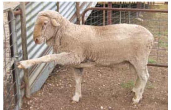
Pastora Poll 5.107 will point your genetics in the right direction.

The sire evaluation consists of 12 rams sourced from across Australia and represents some very progressive merino studs.