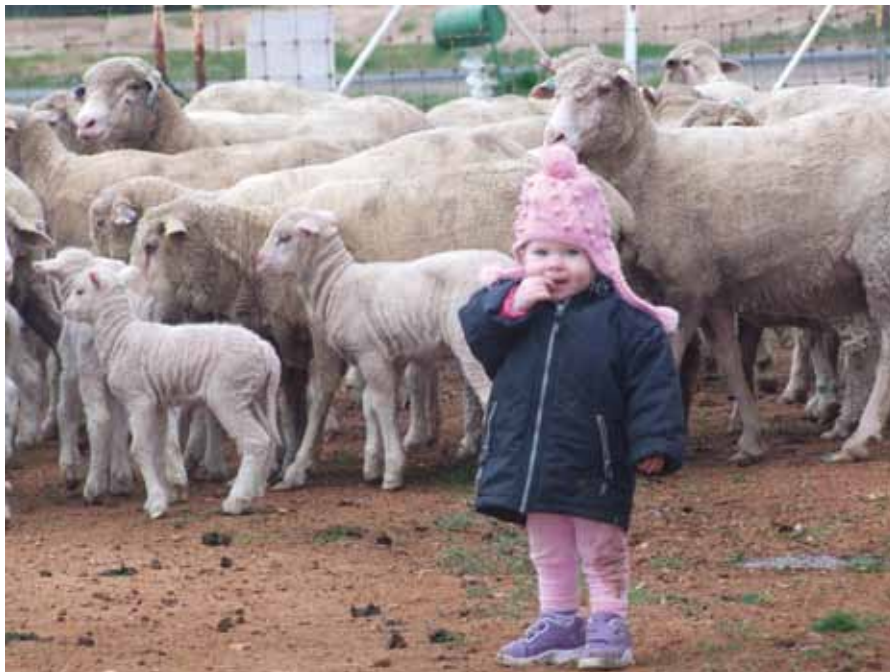
"I wonder if Mum & Dad would notice if I took one home"

You are invited to the Pastora Poll Merinos Open Day, on September 17.