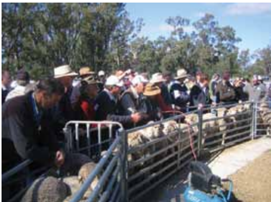
Crowd inspecting the wethers entered in the PWMWT at Collingullie, August 2010

Lastly I'd like to thank all those people who helped me in some way throughout the year. Your help is invaluable and important to the continued success of Pastora Poll Merino's.