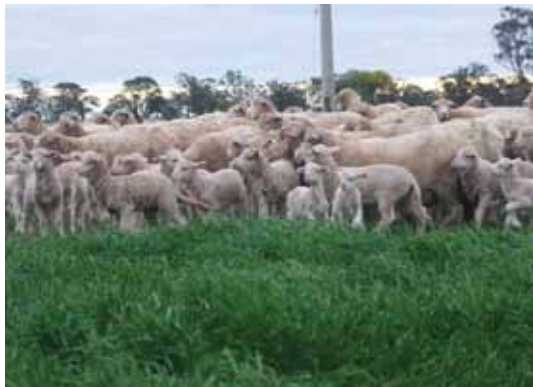
Ewes with 2010 drop lambs. Photo mid August 2010

Semen purchased from Coromandel Poll Merino Stud...107 lambs now on the ground by Sir Thomas 7.002