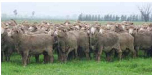
2009 drop sale rams taken mid August 2010